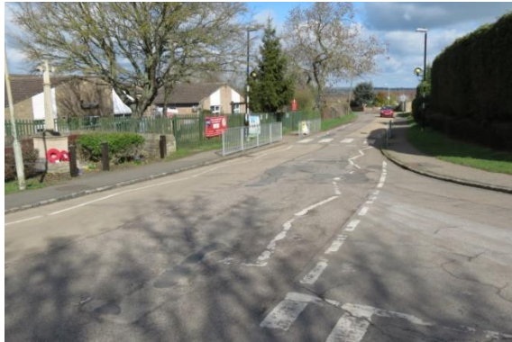
Mill Road prior to resurfacing