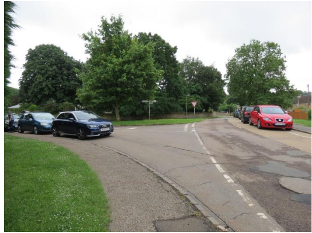
The Triangle close to the Primary School

The land in Glover Court has been deemed unsuitable for car parking, The Spread Eagle has occasionally helped with the park and stride scheme but, with the closure of the public house this is unlikely to continue.