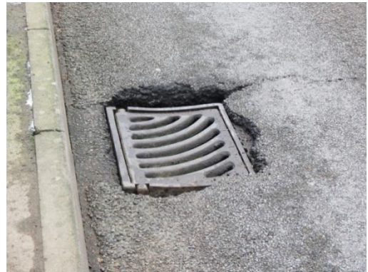
Sunken Grate High Street