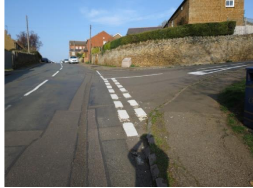
The junction of Blind Lane and Rockingham Road