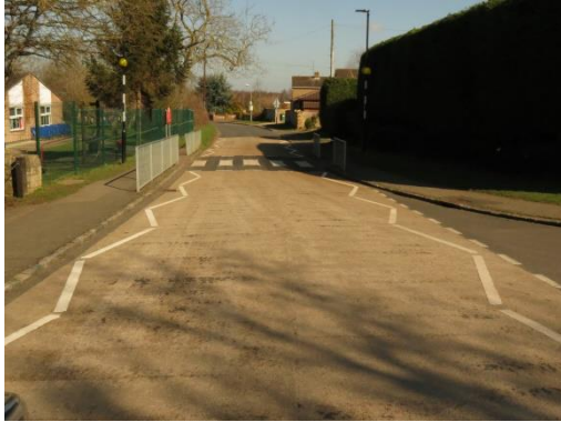
School Zebra Crossing.

Many road markings in the village were renewed last year and whilst some have faded they are generally acceptable.