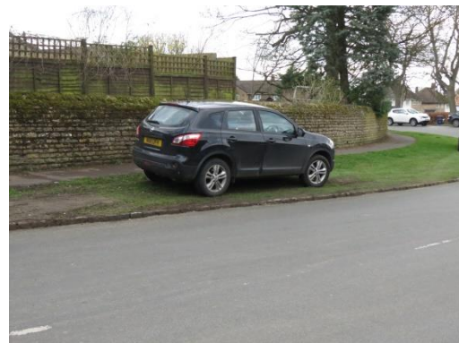
Example from 2022 Report

Parents collecting children from school are now regularly damaging the verges and have even been seen to park on the triangle near the school.