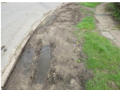
Top left – Bancroft Road