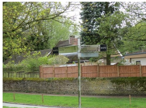
(From Highways Report V7 2023)

Most of the village signs are in need of a wash. The finger posts on the triangle near the school and the sign at the bottom of Corby Road are all dirty. The Parish Council did have some success getting the Give Way sign at the junction of Corby Road and the old Harborough Road cleaned. However, once cleaned the sign was shown to be very faint.