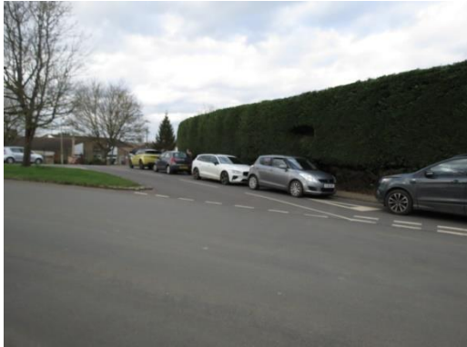
Example from 2022 Report

All attempts to find parking spaces for some of the cars have failed. The Mill development, which could alleviate some of the parking issues, is still not on stream. There is some evidence that the car park for the old Spread eagled public house is being used by some parents.