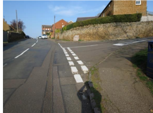
The junction of Blind Lane and Rockingham Road

The Parish Council made a request to paint yellow no parking lines around bottom of High Street. It was the Council's view that parking during school opening and leaving times was causing a problem to the verge and a hazard to through traffic.