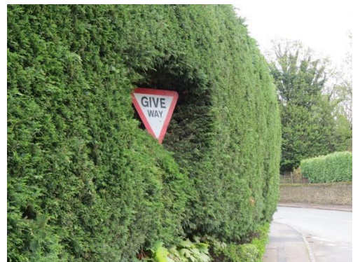
(Prior to hedge removal)